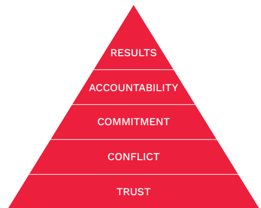
The Five Behaviors Model

The experience is completed through a half-day training session, led by a trained Five Behaviors expert. This session includes a walkthrough of the Personal Development profile, breakout activities, and group discussion.